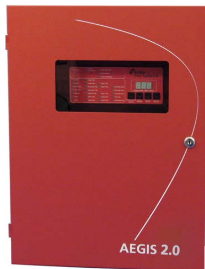
AEGIS 2.0 Control Unit