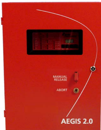
AEGIS 2.0 Control Unit with Switches